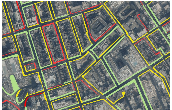
Detailed view of Central London showing UKMap pavements coloured by minimum width with aerial imagery background. (Red less than 2m, Yellow 2-3m and Green greater than 3m)

As it is not always evident where pavements start or end, Verisk 3D Visual Intelligence tapped into 1Spatial's FME expertise to help finalise the last step in the solution. The speed at which FME enabled the two organisations to work together – from initial concept to data delivery – was pivotal to their success which was reliant on the analysis of 250,000 polygons and 4.2 million width calculations.